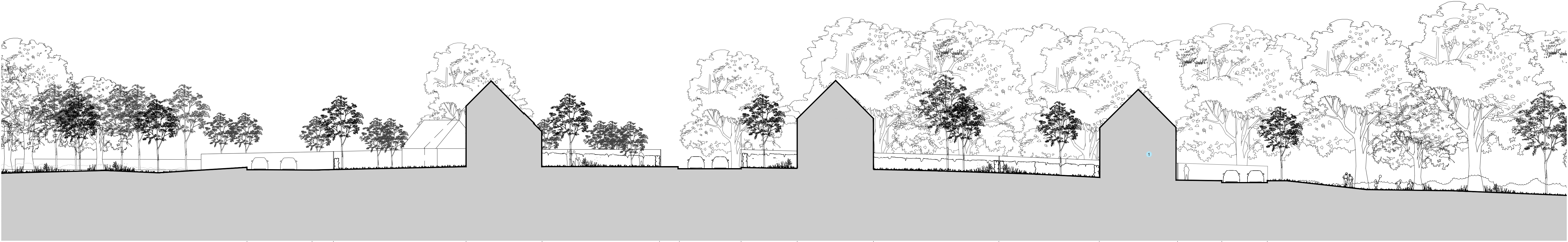
PROPOSED SITE SECTION B-B

Access road Pavement Plot 8 garden Plot 8 Plot 8 garden Pavement Access road Plot 19 garden Plot 19 Plot 19 garden Plot 15 garden Plot 15 Access road