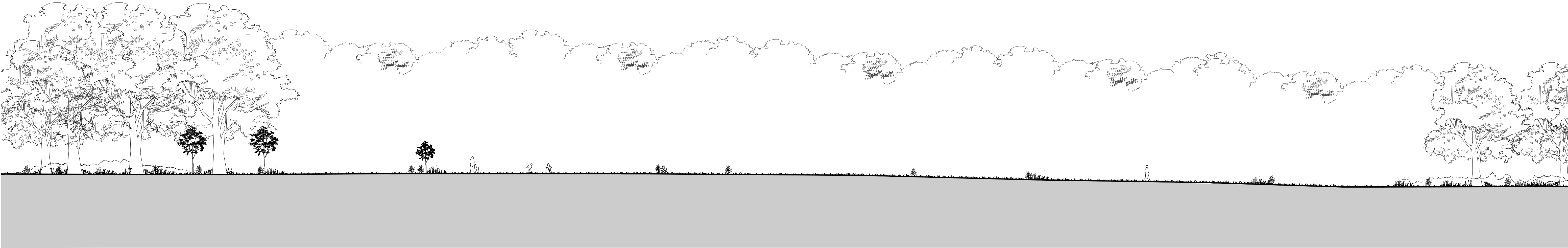
EXISTING SITE SECTION A-A